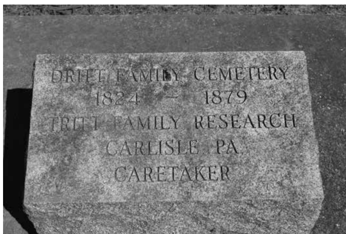
Tritt Family Research caretaker marker